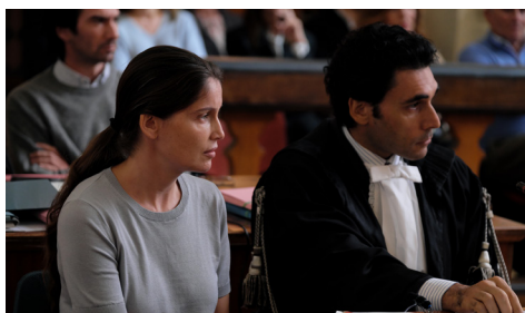
A DARK STORY