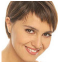
Director Paola Cortellesi

Cast Paola Cortellesi, Valerio Mastandrea, Romana Maggiora Vergano, Emanuela Fanelli, Giorgio Colanageli, Vinicio Marchioni