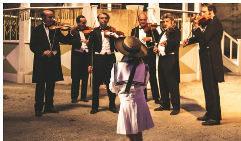
IL TEMPO CHE CI VUOLE