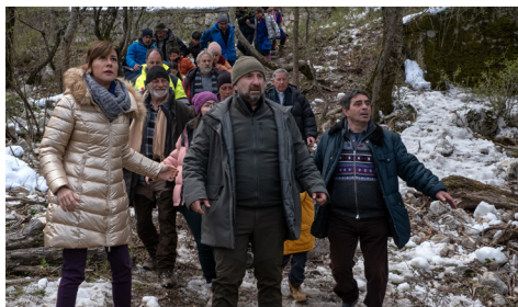
A WORLD APART