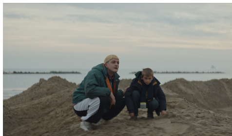
MY KILLER BUDDY